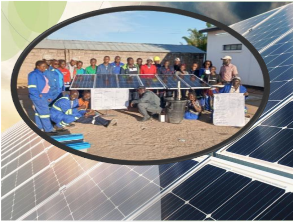
Ground mounting of solar pannels by ZCA-Monze trainees