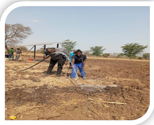
Pumping water using solar Energy