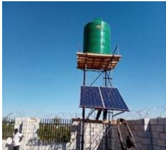
Tank, solar pannels supplying power to the pump