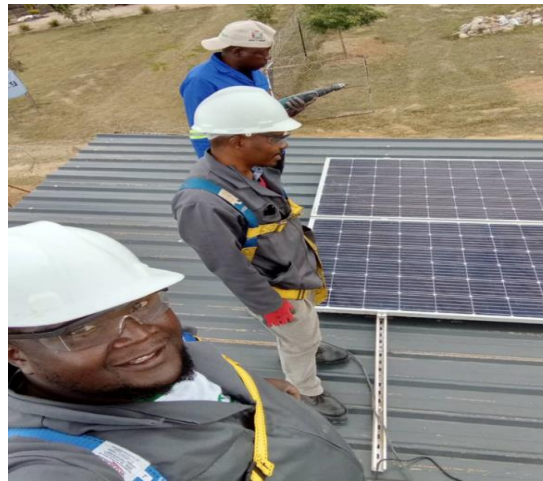
Roof mounting of solar panels by ZCA-Monze trainees