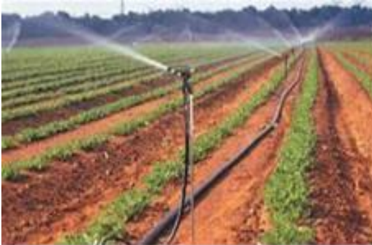
Solar energy application in irrigation