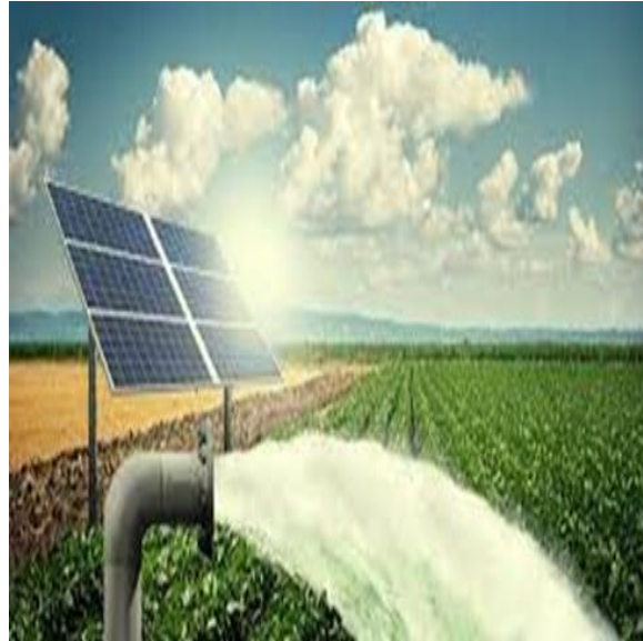
Pumping water using solar Energy