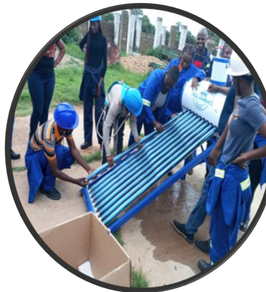
Installation of Solar geyser by ZCA-Monze trainees